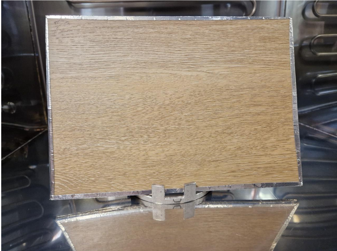
The test specimens of the chemical evaluation.